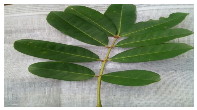
Figure 2. Zanthoxylum macrophylla leaf morphology.