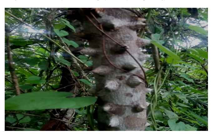
Figure 3. Zanthoxylum macrophylla stem.

Materials/chemicals used: The following materials were used for the proximate analysis: Dessicator, muffle furnace, spectrometer, silica dish, kjeldahl flask, funnel, soxhlet apparatus, thimble, electric oven, grinder, retort stand, cotton wool, beakers, weighing balance, petri dish, platinum crucible, filter paper. The chemicals used include petroleum ether, Tetraoxosulphate (vi) acid, Boric acid indicator solution, Sodium hydroxide, hydrochloric acid. Proximate composition (ash content, protein content, fat content, crude fibre and moisture content) was carried out using the standard methods described by Association of Official Analytical Chemist (AOAC, 2005).