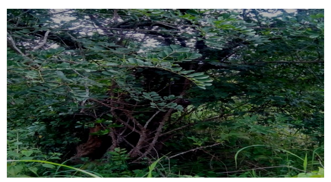
Figure 1 . Zanthoxylum macrophylla tree in its natural habitat. Location (Mbulu-owo Nkanu East L.G.A Enugu state).

Preparation of plant samples : The leaf, root and stem of the plant was collected, washed, sliced to reduce its surface area, spread on a stainless tray and allowed to dry at room temperature for 8days, it was then taken to the mill, packed in an air tight container and labelled.