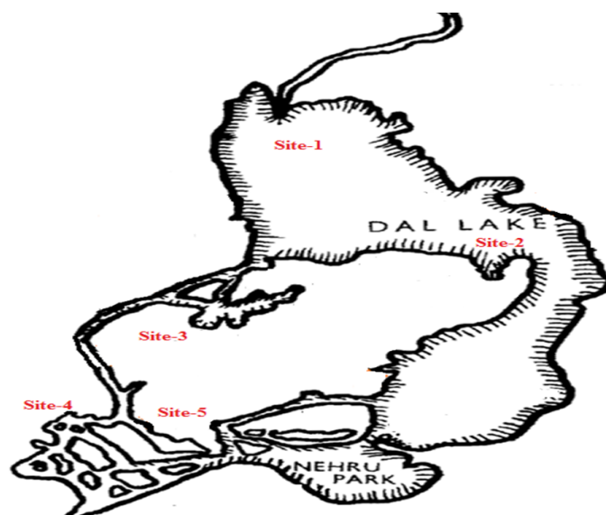
Figure 1. Map showing sampling sites at Dal Lake, Jammu & Kashmir, India.