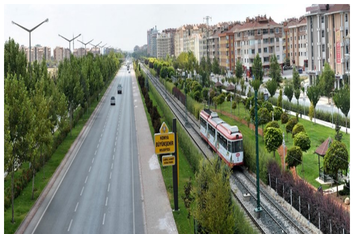
Figure 2. Study area and its surroundings.