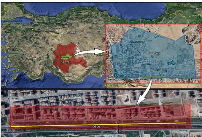
Figure 1. Location of the study area (Adapted from Google Earth).