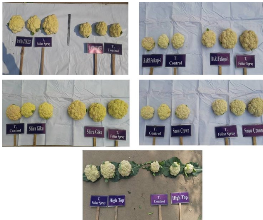
Figure 1. Pictorial view of micronutrient with hormone and control effect of different varieties of cauliflower.