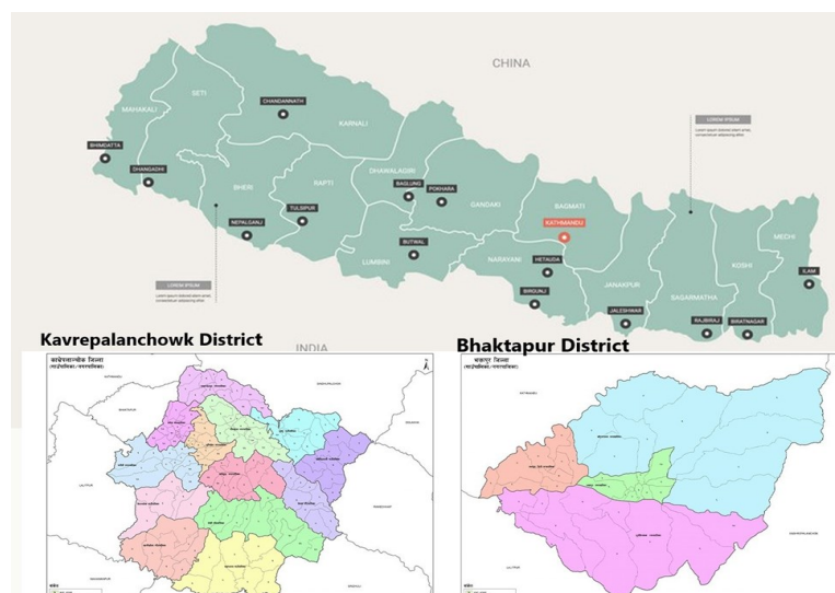
Figure 1. Map of research area.

A structured questionnaire survey was conducted on the selected farms to gather relevant information. The questionnaire covered i) Owner's name, ii) Number of pigs, iii) Age, iv) Feeding system, v) Vaccination status, vi) Purpose of rearing, vii) Waste management, viii) Disposal of carcass, ix) History of abortion, and x) Housing system.