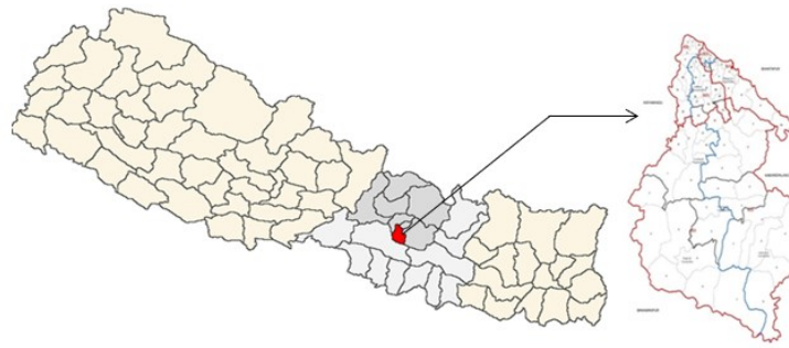
Figure 1. Map of study area- Lalitpur, Nepal.

agricultural practices by cultivating Taxus wallichiana on their farmlands, to generate income and provide employment opportunities. This specific study was conducted in the Mahankal Rural Municipality within the Lalitpur district, focusing on the analysis of production and marketing dynamics related to Himalayan yew (Figure 1).